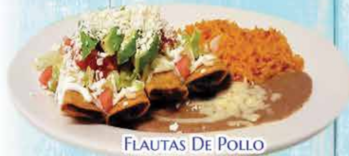
FLAUTAS DE POLLO

4 TIGHTLY ROLLED CORN TORTILLAS WITH SHREDDED CHICKEN, TOPPED WITH LETTUCE, AVOCADO, SOUR CREAM AND MEXICAN CHEESE, SERVED WITH RICE AND BEANS. .... $11.84