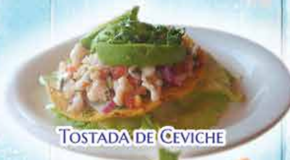
TOSTADA DE CEVICHE