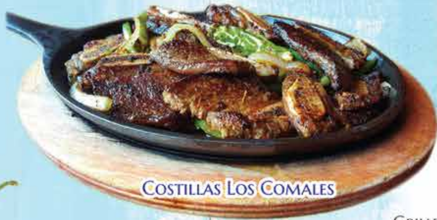
COSTILLAS LOS COMALES