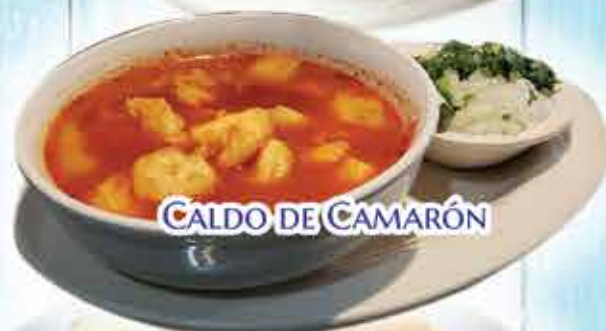
CALDO DE CAMARÓN