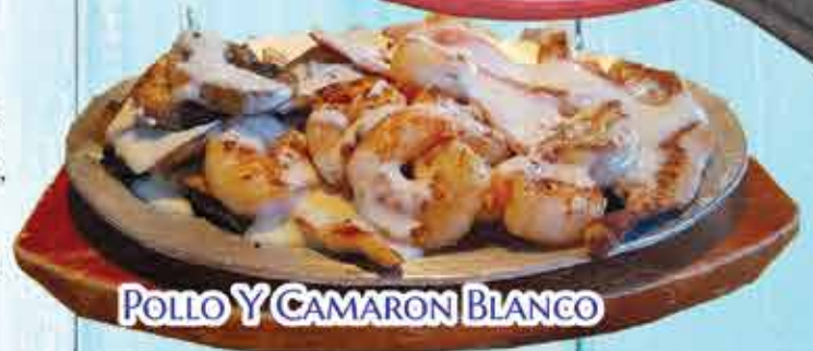
POLLO Y CAMARON BLANCO

POLLO Y CAMARON BLANCO (WHITE CHICKEN AND SHRIMP) GRILLED CHICKEN, HAM AND SHRIMP COOKED WITH MUSHROOMS, ONIONS AND BELL PEPPERS, TOPPED WITH CHEESE DIP. SERVED WITH RICE, BEANS, LETTUCE, GUACAMOLE, PICO DE GALLO, SOUR CREAM AND TORTILLAS..... $16.40