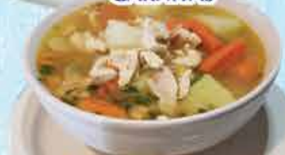
SOPA DE POLLO

MADE WITH CHUNKS OF CHICKEN, RICE, TOMATOES, ONIONS, CILANTRO, POTATOES, CARROTS, CHAYOTE AND AVOCADO.....$10.93